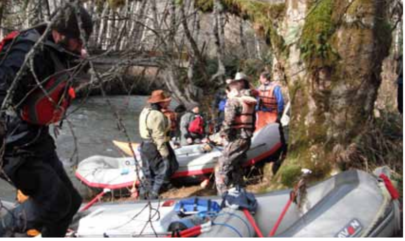
Safety talk at launch