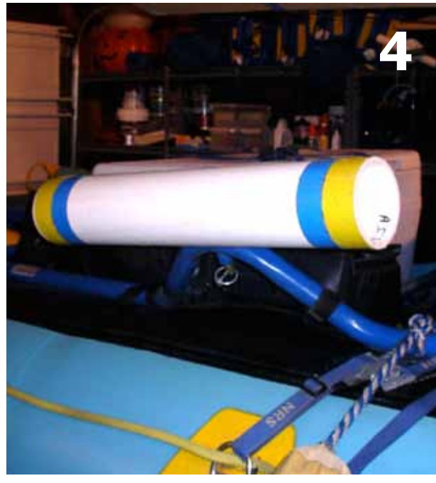
You can now load a boat on top and secure with straps. The boat will rest snugly on the PVC pipes.