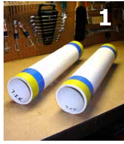
Purchase two pieces of 4-inch PVC conduit at Home Depot or Lowe's. They will be happy to cut it for you.

Many rafters haul two boats via piggyback on a flatbed trailer. This always presents a problem of seating the top boat on the lower boat in a way to avoid damage to the raft material. To solve this problem, use 4-inch PVC conduit as illustrated in the following photos.