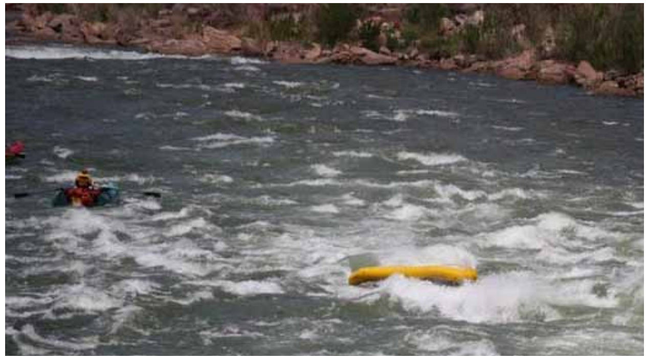
Flipped in Hance

At Matcatamiba the water was so high we rowed our boats a good 75 yards back into the Canyon. Havasu was brilliant blue as usual. Upset Rapid was basically a washout,