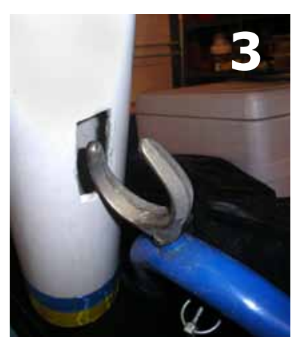
This rectangular hole will fit over your oar lock.