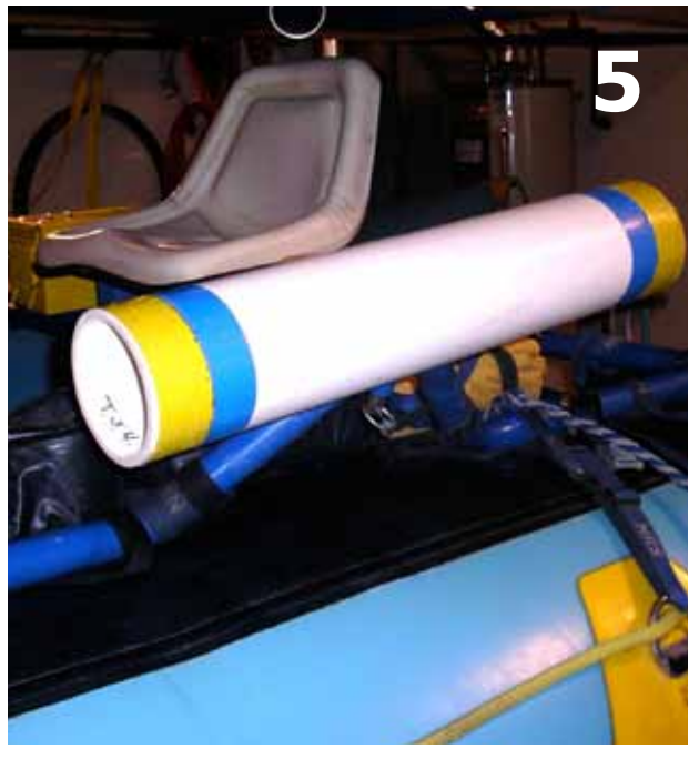
When securing with straps, use two straps on each side, and a fifth strap to secure the bow.