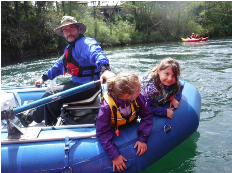
Continued from page 1

The next morning, after un-tetrissing the vehicles in the parking lot, we moved to Packsaddle Park where more and more and more showed up. Thank you to all that assisted in herding the cats, doing safety briefs, running lead and sweep and all that participated. In the end we launched 39 boats (cats, paddle rafts, oar rafts and IKs). We had to split into two groups just to get boats in the water. I'm not sure how many humans (had to have been close to 60) participants we had on Saturday but they were joined by at least three dogs and one, very small gosling.