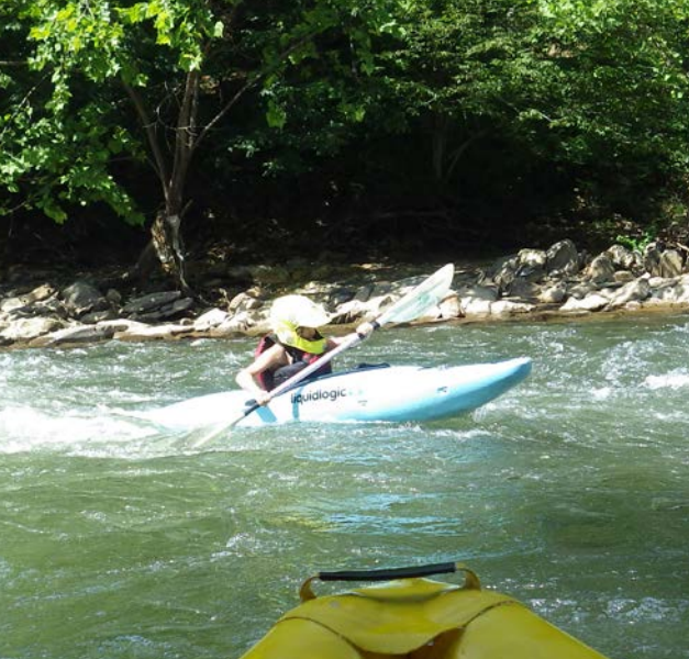
All smiles on the Nantahala River