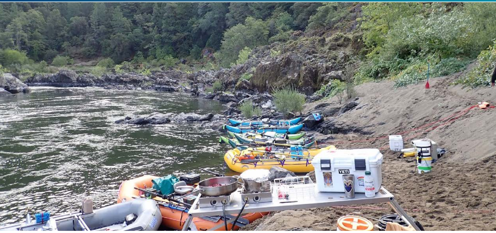
Roque River Kitchen